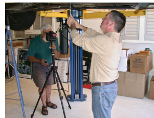
Bentley technical editors documenting fuel filter replacement.

Bentley repair manuals provide the highest level of clarity and comprehensiveness for service and repair procedures. If you're looking for better understanding of your 2000 through 2006 BMW X5, look no further than Bentley.